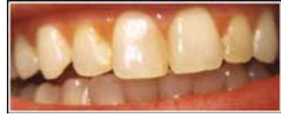
Before Pola Night Whitening

Our bleaching kits are on offer @ £250.00