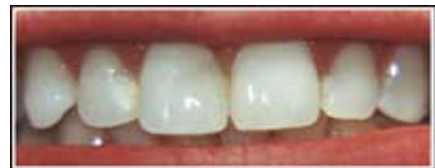
After using Pola Night Whiten-